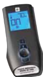
GreenSmart ™ Remote Control