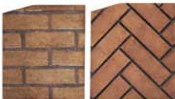
Reversible Ceramic Fireback

Scan the QR Code to watch a video of the Berkshire burning. See back page for information on how to use a QR Code. http://vimeo.com/15269440